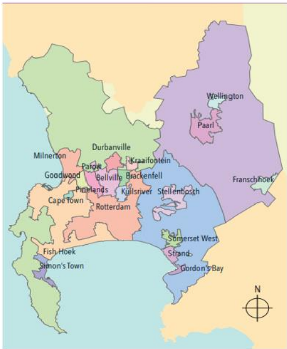
City of Cape Town former administrations and local authorities, pre-1996