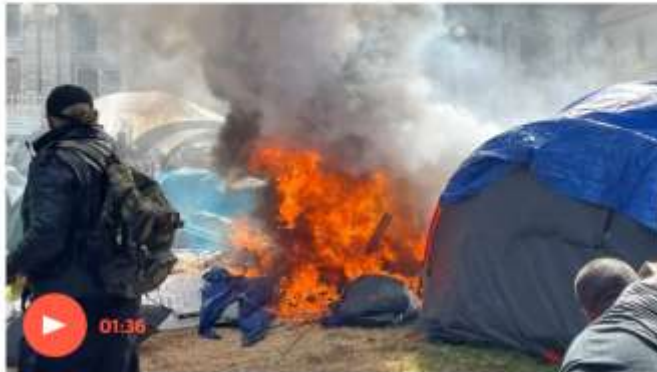
Fires and clashes break out at Covid protest outside New Zealand parliament - video

Clashes erupt between police in riot-gear and protesters as Māori leaders denounce violence at demonstrations that have run for weeks