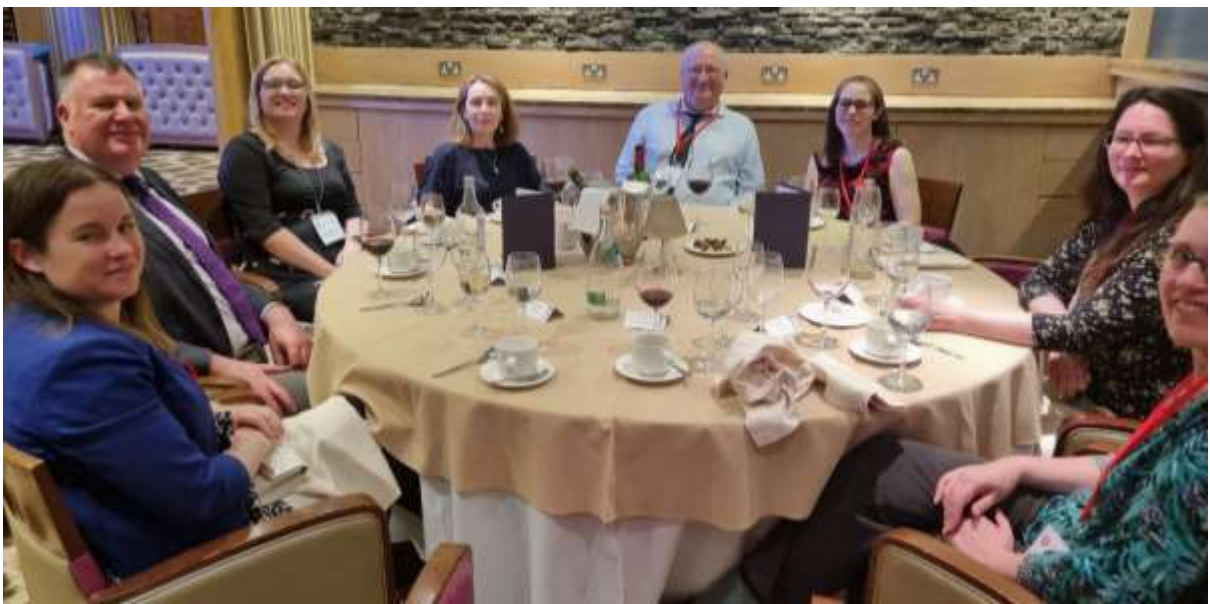
The Jersey team and their guests at the celebration dinner