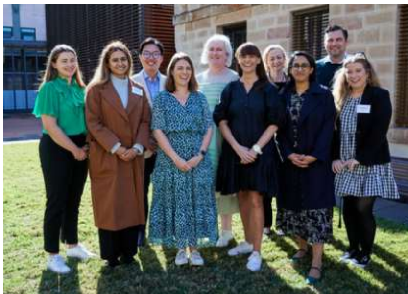
NSW PCO conference organisers