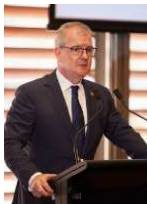
Hon Michael Daley MP, Attorney General

The Hon Michael Daley, MP, Attorney General of New South Wales, also gave an opening address, welcoming attendees, and acknowledging the important work of legislative counsel in his experience as a Councillor and Deputy Mayor on Randwick City Council, as a Member for Maroubra in the NSW Parliament and, later, as Minister for Roads, Minister for Police, Minister for Finance, shadow Treasurer, and now as Attorney General in the NSW Parliament.