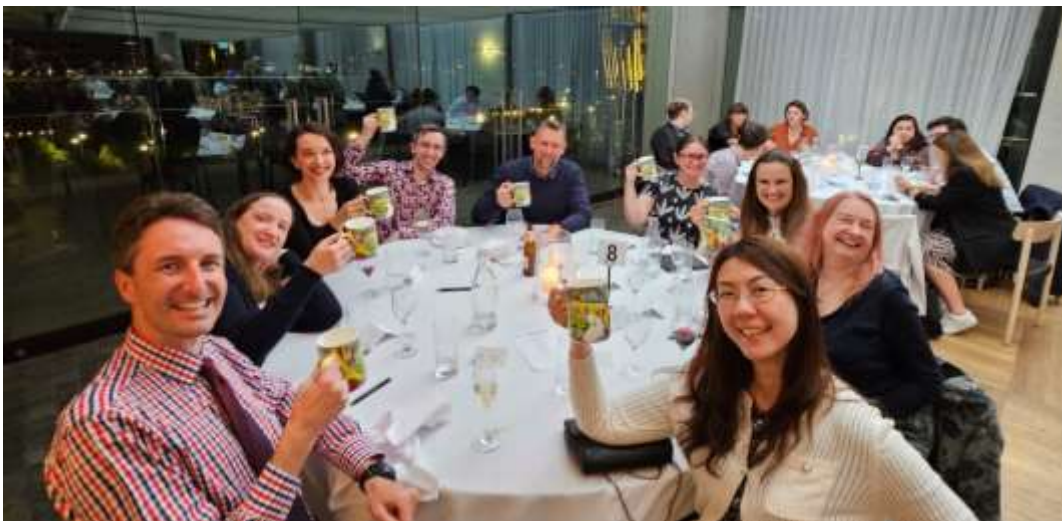
The quiz team posing with their victors' mugs.