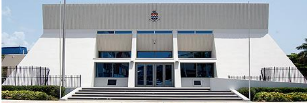
The Cayman Islands Legislative Assembly ("the LA")