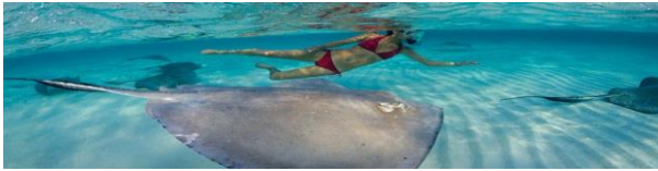
Stingray City – Grand Cayman

In addition to the world-famous Seven Mile Beach (recently voted the best beach in the world), one of Grand Cayman's most-striking features, is the shallow, reef-protected lagoon, the North Sound, which is approximately 35 square miles and boasts the world-famous "Stingray City".