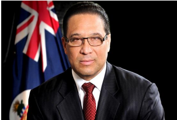
The Premier, Hon Alden M McLaughlin Jr. MBE JP MLA Ministry of Home Affairs, Health & Culture

The Premier of the Cayman Islands is the political leader and head of Government and is appointed by the Governor in accordance with the Cayman Islands Constitution, 2009. The 2009 Cayman Islands Constitution caused additional devolution of power from the Governor to the Executive, and the Executive now has greater responsibility for some matters relating to external affairs, formal negotiations, international agreements, and local political declarations that affect foreign policy.