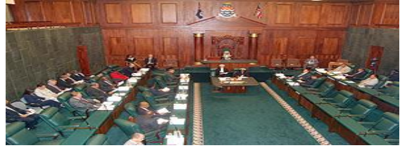
The House in Session (in the LA)

The Legislature is unicameral and comprises the Governor 6 , two Ex-Officio Members 7 (the Deputy Governor and the Attorney General) appointed by the Governor, and eighteen democratically-elected members, known as Members of the Legislative Assembly 8 ("MLAs") for the Islands' six districts.