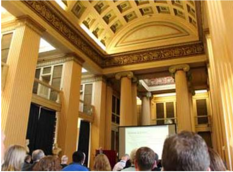
Playfair Library Hall, Edinburgh