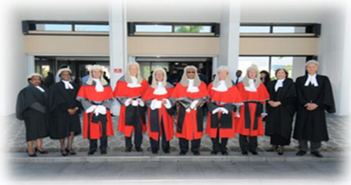
Judges and Magistrates of the Cayman Islands Grand Courts and Summary Courts

The judiciary is one of the three separate arms of Government, whose function is to administer the law fairly, efficiently, in the interests of justice, and independently of the Executive and Legislative branches. The Judges of the Grand Court also provide international legal assistance pursuant to treaties such as the Legal Assistance Treaty with the United States of America. The Judiciary is comprised of the following jurisdictions in ascending order within the hierarchy of the courts: THE SUMMARY COURT , which hears civil and criminal matters (and includes Family, Youth and Coroner's Courts) and THE GRAND COURT , which hears applications for judicial review, cases on criminal, civil, family, and estate matters, and appeals from the Summary Courts. In addition to the general Civil and Criminal Divisions, The Grand Court has three specialist Divisions: the Admiralty Division, the Family Division, and the Financial Services Division. In addition, there is the COURT OF APPEAL , the Highest Court in the Cayman Islands, in which civil and criminal appeals from the Grand and Summary Courts can be heard; and the PRIVY COUNCIL , the highest Court, and which can hear and determine an appeal from the Court of Appeal.