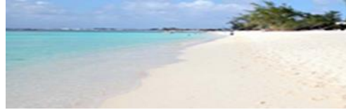
Seven Mile Beach - Grand Cayman